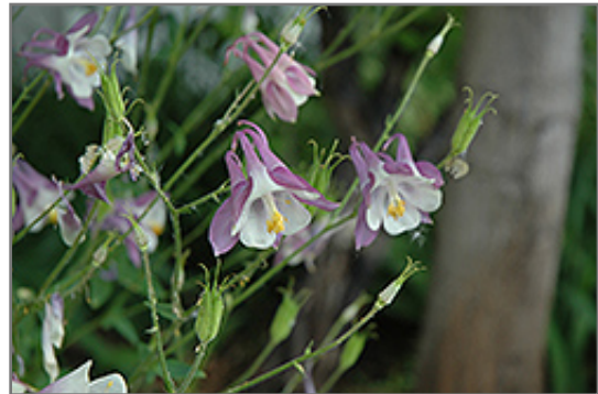
Common Columbine flowers

Common Columbine is an herbaceous perennial with an upright spreading habit of growth. Its medium texture blends into the garden, but can always be balanced by a couple of finer or coarser plants for an effective composition.