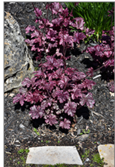
Midnight Rose Coral Bells

We are so proud of the nursery stock that we have carefully selected for superior quality and performance, WE GUARANTEE ALL TREES, SHRUBS, EVERGREENS FOR 2 YEARS, AND ROSES FOR 1 YEAR!