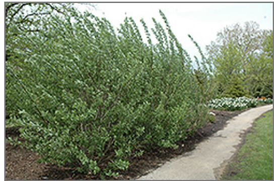
French Pussy Willow

We are so proud of the nursery stock that we have carefully selected for superior quality and performance, WE GUARANTEE ALL TREES, SHRUBS, EVERGREENS FOR 2 YEARS, AND ROSES FOR 1 YEAR!