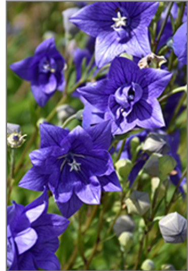
Astra Double Blue Balloon Flower flowers

Astra Double Blue Balloon Flower is recommended for the following landscape applications;