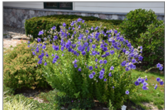
Astra Double Blue Balloon Flower in bloom