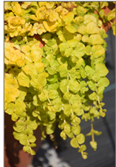
Goldilocks Creeping Jenny foliage

Goldilocks Creeping Jenny is a dense spreading perennial with a ground-hugging habit of growth. Its relatively fine texture sets it apart from other garden plants with less refined foliage.