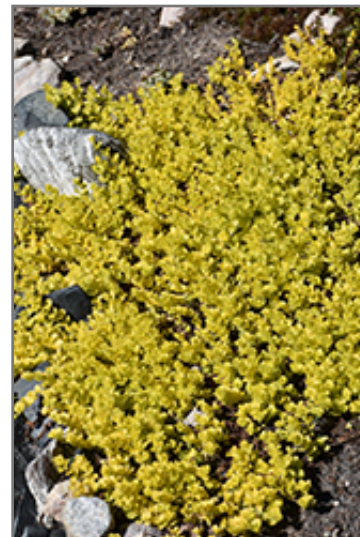
Goldilocks Creeping Jenny

Goldilocks Creeping Jenny is a fine choice for the garden, but it is also a good selection for planting in outdoor containers and hanging baskets. Because of its spreading habit of growth, it is ideally suited for use as a 'spiller' in the 'spiller-thriller-filler' container combination; plant it near the edges where it can spill gracefully over the pot. Note that when growing plants in outdoor containers and baskets, they may require more frequent waterings than they would in the yard or garden. Be aware that in our climate, most plants cannot be expected to survive the winter if left in containers outdoors, and this plant is no exception. Contact our experts for more information on how to protect it over the winter months.