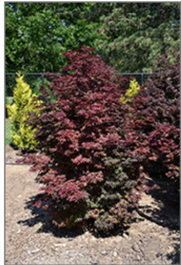
Twombly's Red Sentinel Japanese Maple

We are so proud of the nursery stock that we have carefully selected for superior quality and performance, WE GUARANTEE ALL TREES, SHRUBS, EVERGREENS FOR 2 YEARS, AND ROSES FOR 1 YEAR!