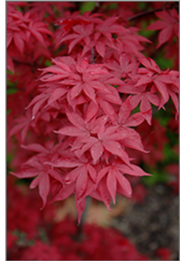
Twombly's Red Sentinel Japanese Maple foliage

Twombly's Red Sentinel Japanese Maple is recommended for the following landscape applications;