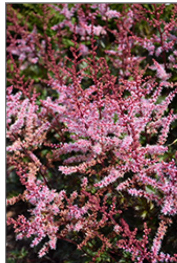
Delft Lace Astilbe flowers

Delft Lace Astilbe is an herbaceous perennial with an upright spreading habit of growth. Its relatively fine texture sets it apart from other garden plants with less refined foliage.