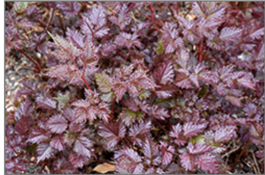
Delft Lace Astilbe foliage