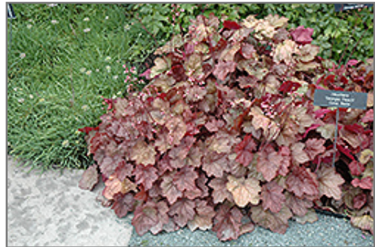
Georgia Peach Coral Bells

This is a relatively low maintenance plant, and should be cut back in late fall in preparation for winter. It is a good choice for attracting hummingbirds to your yard. It has no significant negative characteristics.