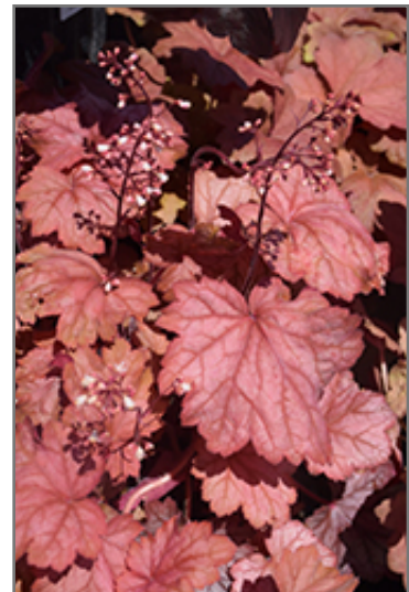
Georgia Peach Coral Bells in bloom

We are so proud of the nursery stock that we have carefully selected for superior quality and performance, WE GUARANTEE ALL TREES, SHRUBS, EVERGREENS FOR 2 YEARS, AND ROSES FOR 1 YEAR!