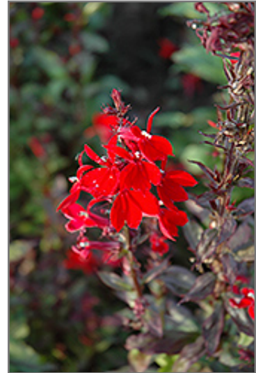
Queen Victoria Lobelia flowers

Queen Victoria Lobelia is recommended for the following landscape applications;