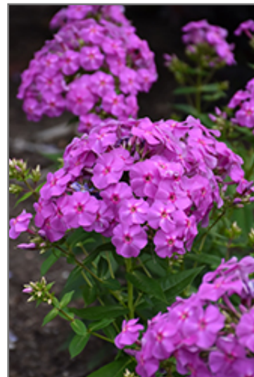
Flame Lilac Garden Phlox flowers