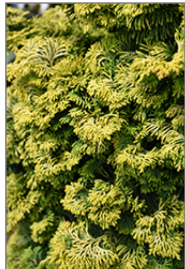
Dwarf Golden Hinoki Falsecypress foliage

We are so proud of the nursery stock that we have carefully selected for superior quality and performance, WE GUARANTEE ALL TREES, SHRUBS, EVERGREENS FOR 2 YEARS, AND ROSES FOR 1 YEAR!