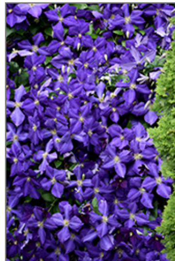
Jackmanii Clematis in bloom

Jackmanii Clematis is recommended for the following landscape applications;