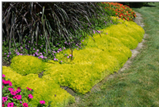
Lemon Coral Stonecrop