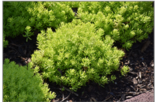
Lemon Coral Stonecrop

We are so proud of the nursery stock that we have carefully selected for superior quality and performance, WE GUARANTEE ALL TREES, SHRUBS, EVERGREENS FOR 2 YEARS, AND ROSES FOR 1 YEAR!