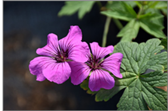
Patricia Cranesbill flowers

We are so proud of the nursery stock that we have carefully selected for superior quality and performance, WE GUARANTEE ALL TREES, SHRUBS, EVERGREENS FOR 2 YEARS, AND ROSES FOR 1 YEAR!