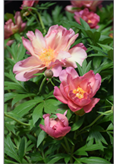
Julia Rose Peony flowers

We are so proud of the nursery stock that we have carefully selected for superior quality and performance, WE GUARANTEE ALL TREES, SHRUBS, EVERGREENS FOR 2 YEARS, AND ROSES FOR 1 YEAR!