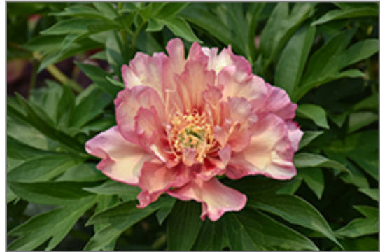
Julia Rose Peony flowers

Julia Rose Peony is an herbaceous perennial with a mounded form. Its medium texture blends into the garden, but can always be balanced by a couple of finer or coarser plants for an effective composition.