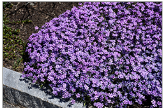
Purple Beauty Moss Phlox in bloom

We are so proud of the nursery stock that we have carefully selected for superior quality and performance, WE GUARANTEE ALL TREES, SHRUBS, EVERGREENS FOR 2 YEARS, AND ROSES FOR 1 YEAR!