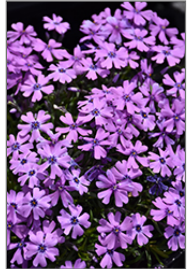
Purple Beauty Moss Phlox flowers

Purple Beauty Moss Phlox is a dense herbaceous evergreen perennial with a ground-hugging habit of growth. It brings an extremely fine and delicate texture to the garden composition and should be used to full effect.