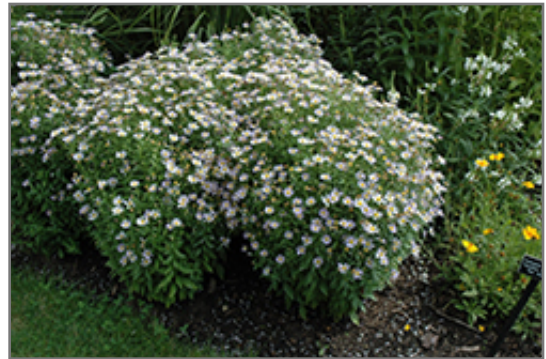
Blue Star Japanese Aster in bloom

We are so proud of the nursery stock that we have carefully selected for superior quality and performance, WE GUARANTEE ALL TREES, SHRUBS, EVERGREENS FOR 2 YEARS, AND ROSES FOR 1 YEAR!