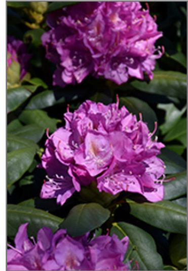
Roseum Elegans Rhododendron flowers

Roseum Elegans Rhododendron is recommended for the following landscape applications;