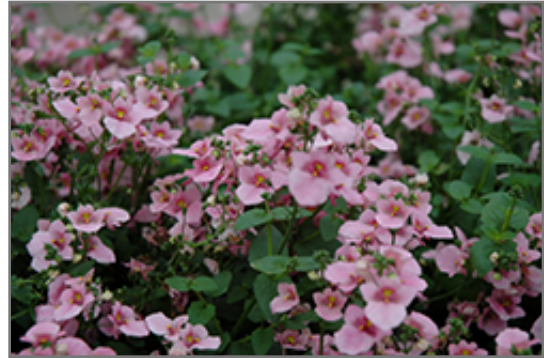
Juliet Light Pink Twinspur flowers

A cool weather, compact and upright series that features mounds of green pointy foliage covered in brightly colored pea-like flowers; excellent performance in containers, hanging baskets or garden beds