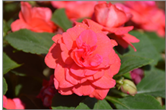
Rockapulco Coral Reef Impatiens flowers

Rockapulco Coral Reef Impatiens is recommended for the following landscape applications;