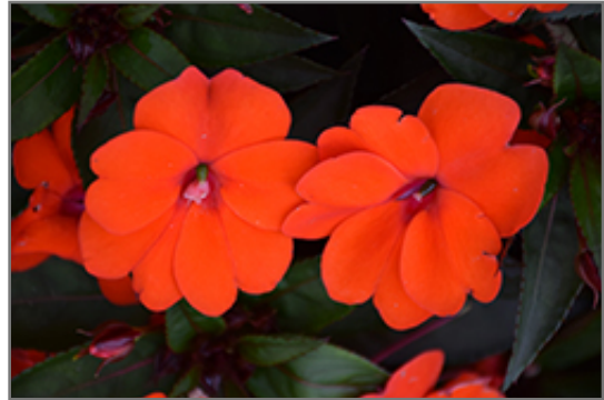
SunPatens Compact Orange New Guinea Impatiens flowers

SunPatens Compact Orange New Guinea Impatiens is a dense herbaceous annual with a mounded form. Its medium texture blends into the garden, but can always be balanced by a couple of finer or coarser plants for an effective composition.