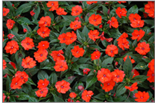
SunPatens Compact Orange New Guinea Impatiens flowers

We are so proud of the nursery stock that we have carefully selected for superior quality and performance, WE GUARANTEE ALL TREES, SHRUBS, EVERGREENS FOR 2 YEARS, AND ROSES FOR 1 YEAR!