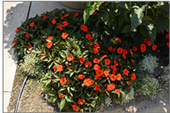
SunPatiens Compact Orange New Guinea Impatiens in bloom