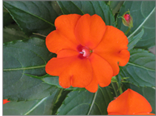
Infinity Orange New Guinea Impatiens flowers

Infinity Orange New Guinea Impatiens is a dense herbaceous annual with a mounded form. Its medium texture blends into the garden, but can always be balanced by a couple of finer or coarser plants for an effective composition.