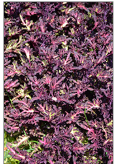
Merlin's Magic Coleus foliage

We are so proud of the nursery stock that we have carefully selected for superior quality and performance, WE GUARANTEE ALL TREES, SHRUBS, EVERGREENS FOR 2 YEARS, AND ROSES FOR 1 YEAR!