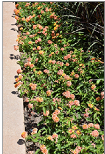
Landmark Citrus Lantana in bloom

We are so proud of the nursery stock that we have carefully selected for superior quality and performance, WE GUARANTEE ALL TREES, SHRUBS, EVERGREENS FOR 2 YEARS, AND ROSES FOR 1 YEAR!