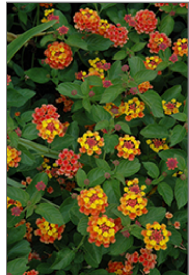
Landmark Citrus Lantana flowers