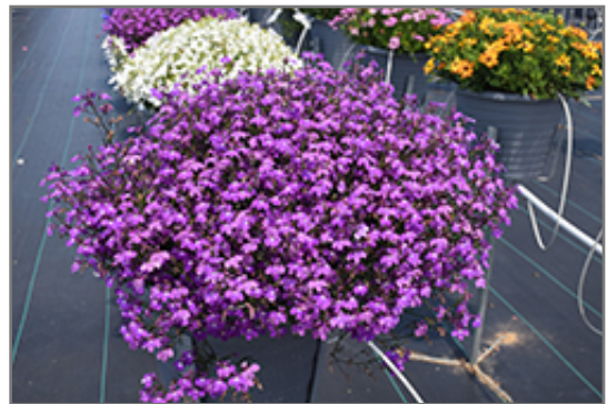
Techno Violet Lobelia in bloom

We are so proud of the nursery stock that we have carefully selected for superior quality and performance, WE GUARANTEE ALL TREES, SHRUBS, EVERGREENS FOR 2 YEARS, AND ROSES FOR 1 YEAR!