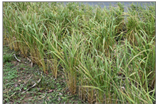
Asian Rice

We are so proud of the nursery stock that we have carefully selected for superior quality and performance, WE GUARANTEE ALL TREES, SHRUBS, EVERGREENS FOR 2 YEARS, AND ROSES FOR 1 YEAR!