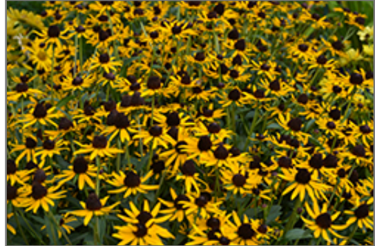
Little Goldstar Coneflower flowers

We are so proud of the nursery stock that we have carefully selected for superior quality and performance, WE GUARANTEE ALL TREES, SHRUBS, EVERGREENS FOR 2 YEARS, AND ROSES FOR 1 YEAR!