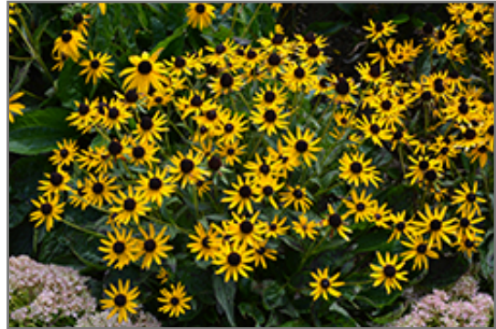
Little Goldstar Coneflower in bloom

Little Goldstar Coneflower is an herbaceous perennial with an upright spreading habit of growth. Its medium texture blends into the garden, but can always be balanced by a couple of finer or coarser plants for an effective composition.