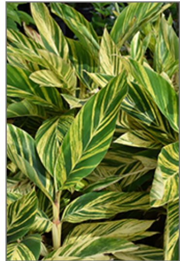
Variegated Shell Ginger foliage

Variegated Shell Ginger is recommended for the following landscape applications;