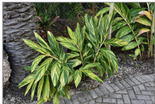
Variegated Shell Ginger

We are so proud of the nursery stock that we have carefully selected for superior quality and performance, WE GUARANTEE ALL TREES, SHRUBS, EVERGREENS FOR 2 YEARS, AND ROSES FOR 1 YEAR!