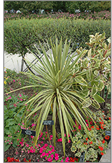
Torbay Dazzler Grass Palm

Torbay Dazzler Grass Palm is recommended for the following landscape applications;