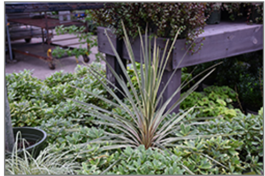
Torbay Dazzler Grass Palm

We are so proud of the nursery stock that we have carefully selected for superior quality and performance, WE GUARANTEE ALL TREES, SHRUBS, EVERGREENS FOR 2 YEARS, AND ROSES FOR 1 YEAR!