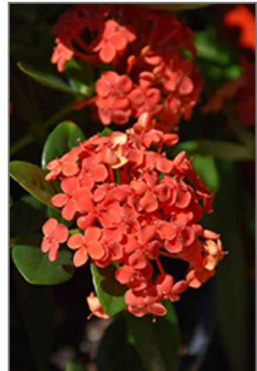
Maui Ixora flowers

We are so proud of the nursery stock that we have carefully selected for superior quality and performance, WE GUARANTEE ALL TREES, SHRUBS, EVERGREENS FOR 2 YEARS, AND ROSES FOR 1 YEAR!