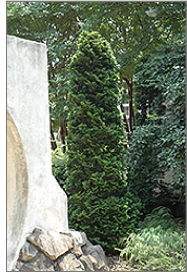
Dark Green Arborvitae

We are so proud of the nursery stock that we have carefully selected for superior quality and performance, WE GUARANTEE ALL TREES, SHRUBS, EVERGREENS FOR 2 YEARS, AND ROSES FOR 1 YEAR!