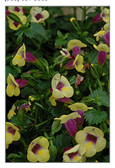
Yellow Moon Torenia flowers

Yellow Moon Torenia is an herbaceous annual with a trailing habit of growth, eventually spilling over the edges of hanging baskets and containers. Its relatively fine texture sets it apart from other garden plants with less refined foliage.