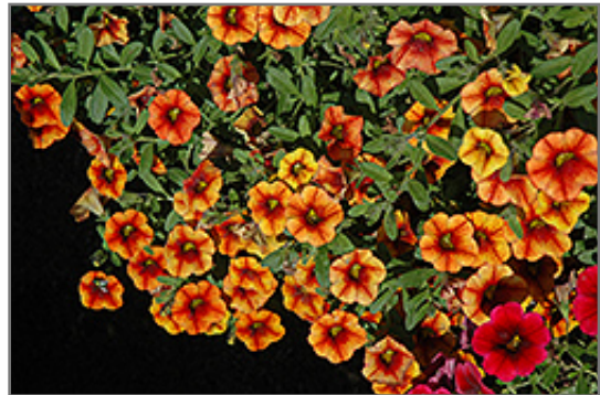
Superbells Spicy Calibrachoa flowers

Superbells Spicy Calibrachoa is recommended for the following landscape applications;