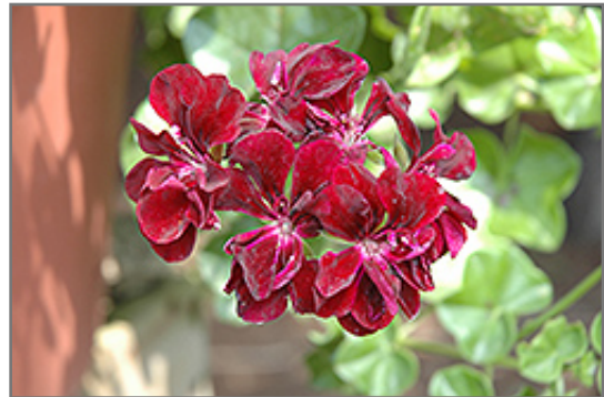
Precision Dark Burgundy Ivy Leaf Geranium flowers

We are so proud of the nursery stock that we have carefully selected for superior quality and performance, WE GUARANTEE ALL TREES, SHRUBS, EVERGREENS FOR 2 YEARS, AND ROSES FOR 1 YEAR!