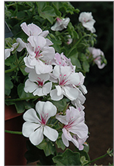
Precision White Red Eye Ivy Leaf Geranium flowers

We are so proud of the nursery stock that we have carefully selected for superior quality and performance, WE GUARANTEE ALL TREES, SHRUBS, EVERGREENS FOR 2 YEARS, AND ROSES FOR 1 YEAR!