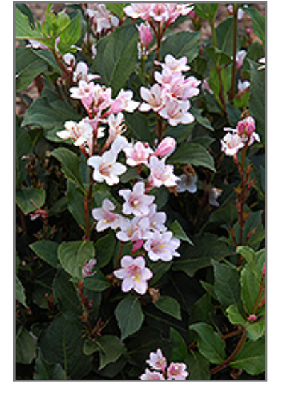
Polka Weigela flowers

This shrub will require occasional maintenance and upkeep, and should only be pruned after flowering to avoid removing any of the current season's flowers. It is a good choice for attracting hummingbirds to your yard. It has no significant negative characteristics.