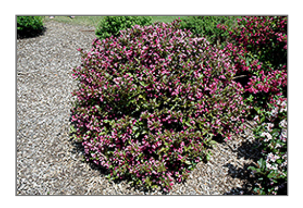
Polka Weigela in bloom