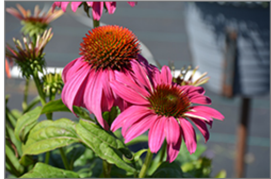
Cheyenne Spirit Coneflower flowers