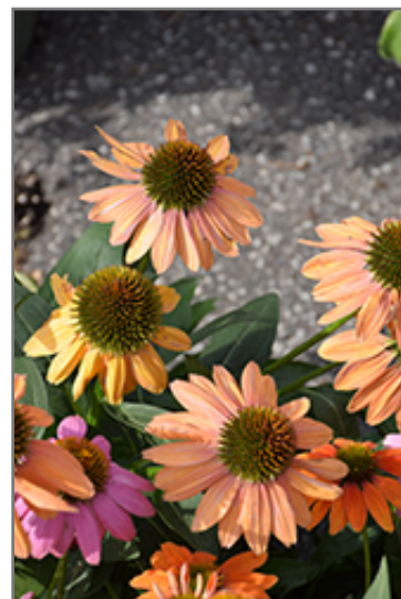
Cheyenne Spirit Coneflower flowers

We are so proud of the nursery stock that we have carefully selected for superior quality and performance, WE GUARANTEE ALL TREES, SHRUBS, EVERGREENS FOR 2 YEARS, AND ROSES FOR 1 YEAR!