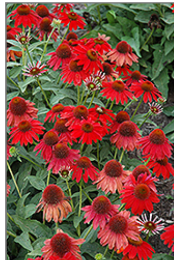
Sombrero Salsa Red Coneflower flowers

Sombrero Salsa Red Coneflower is an herbaceous perennial with an upright spreading habit of growth. Its medium texture blends into the garden, but can always be balanced by a couple of finer or coarser plants for an effective composition.