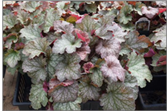
Carnival Fall Festival Coral Bells foliage

Carnival Fall Festival Coral Bells is recommended for the following landscape applications;