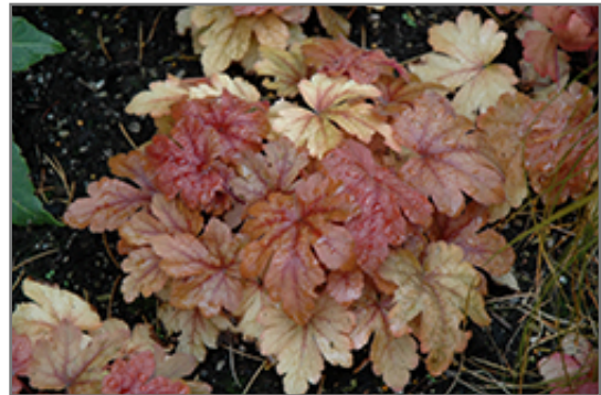
Buttered Rum Foamy Bells

Buttered Rum Foamy Bells is a dense herbaceous evergreen perennial with tall flower stalks held atop a low mound of foliage. Its medium texture blends into the garden, but can always be balanced by a couple of finer or coarser plants for an effective composition.