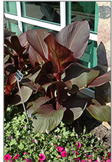
Tropicanna Black Canna

This plant is native to the tropics and prefers growing in moist environments with evenly warm conditions all year round. In our climate, it is usually grown as an outdoor annual in the garden or in a container. If you want it to survive the winter, it can be brought in to the house and provided with special care, and then returned to the garden the following season. In its preferred tropical habitat, it can grow to be around 5 feet tall at maturity, with a spread of 24 inches. However, when grown as an annual or when overwintered indoors, it can be expected to perform differently, and its exact height and spread will depend on many factors; you may wish to consult with our experts as to how it might perform in your specific application and growing conditions.