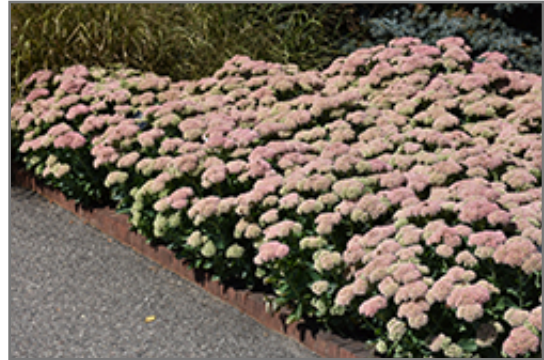
Autumn Joy Stonecrop in bloom

This is a relatively low maintenance plant, and is best cleaned up in early spring before it resumes active growth for the season. It is a good choice for attracting bees and butterflies to your yard, but is not particularly attractive to deer who tend to leave it alone in favor of tastier treats. It has no significant negative characteristics.