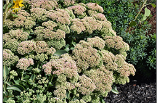
Autumn Joy Stonecrop in bloom

We are so proud of the nursery stock that we have carefully selected for superior quality and performance, WE GUARANTEE ALL TREES, SHRUBS, EVERGREENS FOR 2 YEARS, AND ROSES FOR 1 YEAR!