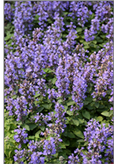
Purrsian Blue Catmint flowers

This plant will require occasional maintenance and upkeep, and is best cleaned up in early spring before it resumes active growth for the season. It is a good choice for attracting butterflies to your yard, but is not particularly attractive to deer who tend to leave it alone in favor of tastier treats. Gardeners should be aware of the following characteristic(s) that may warrant special consideration;