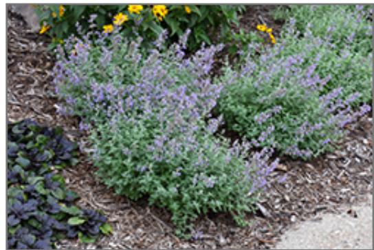
Purrsian Blue Catmint in bloom

We are so proud of the nursery stock that we have carefully selected for superior quality and performance, WE GUARANTEE ALL TREES, SHRUBS, EVERGREENS FOR 2 YEARS, AND ROSES FOR 1 YEAR!