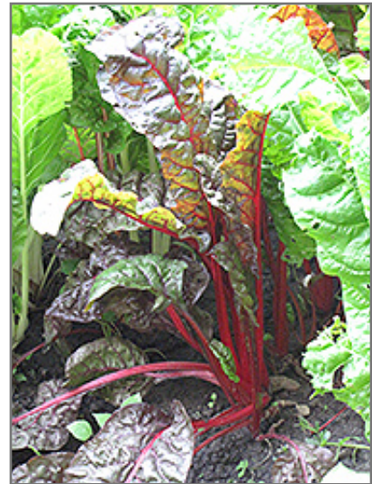
Rhubarb Swiss Chard

Rhubarb Swiss Chard will grow to be about 24 inches tall at maturity, with a spread of 24 inches. This fast-growing vegetable plant is an annual, which means that it will grow for one season in your garden and then die after producing a crop. Because of its relatively short time to maturity, it lends itself to a series of successive plantings each staggered by a week or two; this will prolong the effective harvest period.