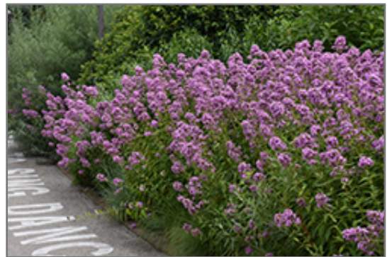
Jeana Garden Phlox in bloom

We are so proud of the nursery stock that we have carefully selected for superior quality and performance, WE GUARANTEE ALL TREES, SHRUBS, EVERGREENS FOR 2 YEARS, AND ROSES FOR 1 YEAR!