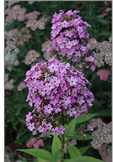
Jeana Garden Phlox flowers

Jeana Garden Phlox is a dense herbaceous perennial with an upright spreading habit of growth. Its medium texture blends into the garden, but can always be balanced by a couple of finer or coarser plants for an effective composition.