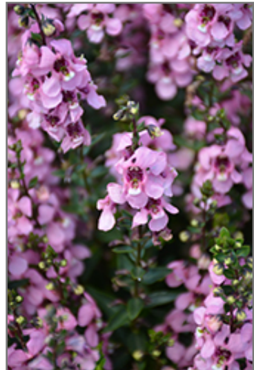
Serenita Pink Angelonia flowers

We are so proud of the nursery stock that we have carefully selected for superior quality and performance, WE GUARANTEE ALL TREES, SHRUBS, EVERGREENS FOR 2 YEARS, AND ROSES FOR 1 YEAR!