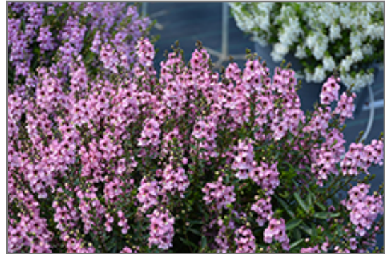
Serenita Pink Angelonia in bloom