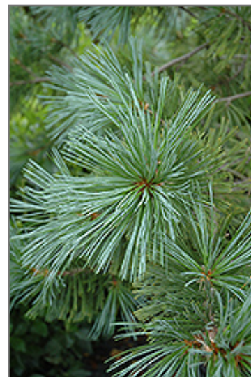
Vanderwolf's Pyramid Pine foliage

We are so proud of the nursery stock that we have carefully selected for superior quality and performance, WE GUARANTEE ALL TREES, SHRUBS, EVERGREENS FOR 2 YEARS, AND ROSES FOR 1 YEAR!