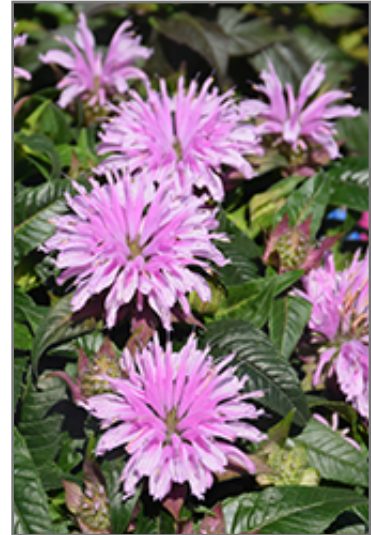
Cotton Candy Beebalm flowers

This plant will require occasional maintenance and upkeep, and should be cut back in late fall in preparation for winter. It is a good choice for attracting bees, butterflies and hummingbirds to your yard, but is not particularly attractive to deer who tend to leave it alone in favor of tastier treats. Gardeners should be aware of the following characteristic(s) that may warrant special consideration;