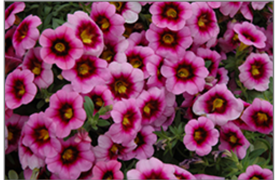
Hula Soft Pink Calibrachoa flowers

Hula Soft Pink Calibrachoa is recommended for the following landscape applications;