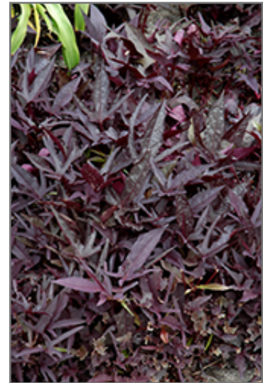
SolarPower Black Sweet Potato Vine foliage

SolarPower Black Sweet Potato Vine is recommended for the following landscape applications;