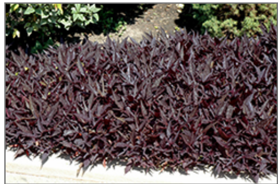
SolarPower Black Sweet Potato Vine